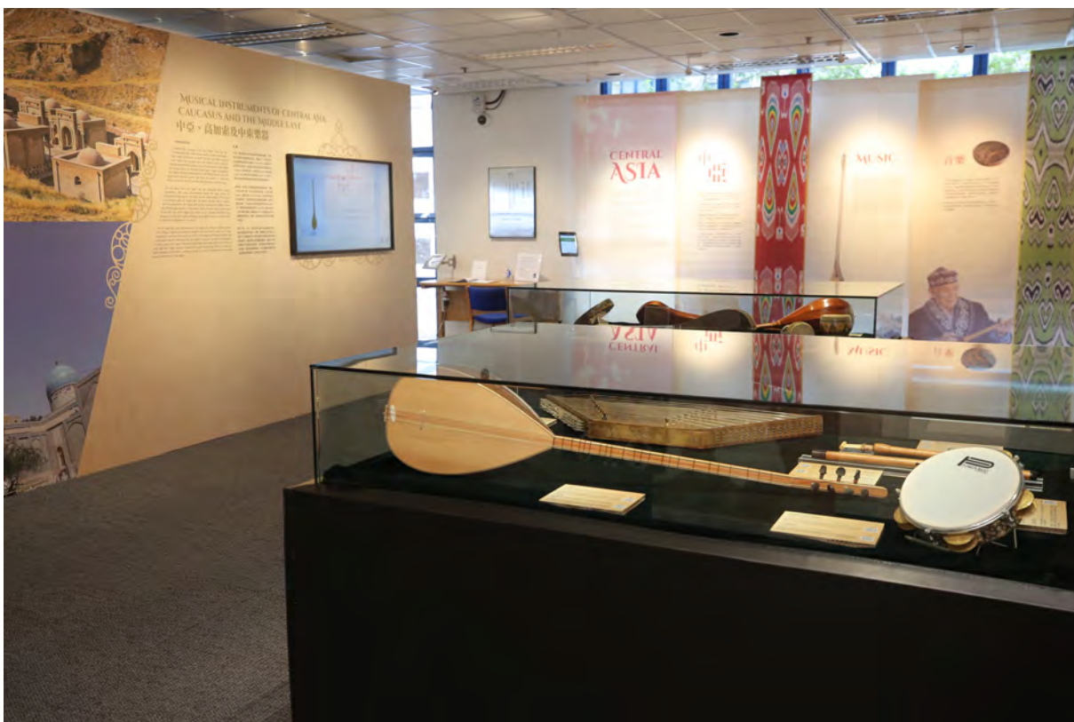
HKUST's Arts Festival presents an exhibition titled "Between Europe and Asia: Traditional Music and Costumes from Central Asia, Caucasus and the Middle East"

The Hong Kong University of Science and Technology (HKUST) Arts Festival 2021 (AF2021) returns with the theme "Art, Despite the Pandemic" – bringing a series of programs including multimedia exhibition, live performances and workshops to the campus, ahead of the opening of the Shaw Auditorium later this year.