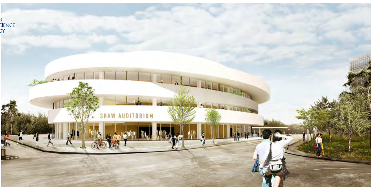
Perspective of the Shaw Auditorium

The five-month exhibition “Between Europe and Asia: Traditional Music and Costumes from Central Asia, Caucasus and the Middle East” marked the inaugural event of AF2021. Merging traditional exhibit display and digital technology, the exhibition marks a new attempt to enhance audience’s multisensory experience with audio-visual equipments. The exhibition held at the Ping Yuan and Kinmay W Tang Gallery of HKUST Lee Shau Kee Library runs from March 24 to September 5. Visitors who wish to visit the Exhibition can fill in the pre-registration form in advance.