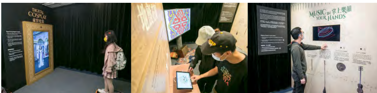
The exhibition introduces three interactive features to enrich user experience - (from left) Digital Cosplay, Carpet Garden, and Music in Your Hand

As Hong Kong’s largest exhibition on Central Asia, Caucasus and Middle East arts in years, the event showcases more than 40 pieces of precious traditional costumes, handmade carpets and musical instruments from those areas - some of which were borrowed from the Consulate General of the Islamic Republic of Iran in Hong Kong and Macao, the Consulate General of the Republic of Kazakhstan in Hong Kong SAR, PRC, as well as the Turkish Consulate General in Hong Kong. Apart from visual appreciation, visitors can “try on” different costumes digitally and take home the pictures with a QR code (Digital Cosplay). They can also paint their own carpet (Carpet Garden) and “play” musical instruments (Music in Your Hand) with multimedia technology installations. Visitors who cannot make it physically can view the exhibits online.